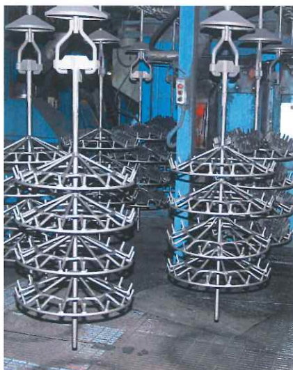
Hanger Shot Blasting