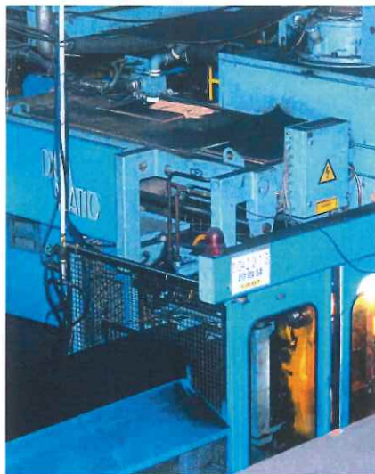
Molding Machine DISA2013MK5