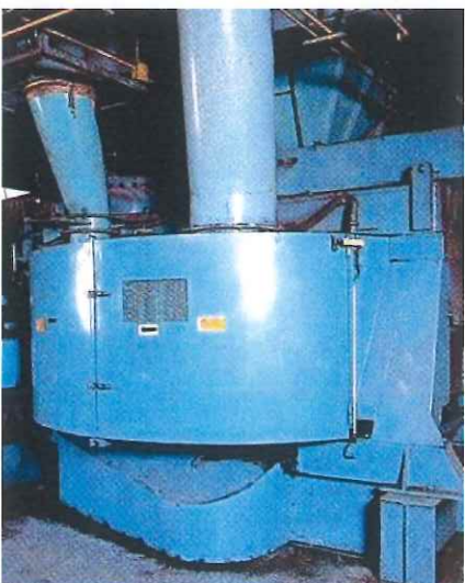
Eirich Mixer DW2914