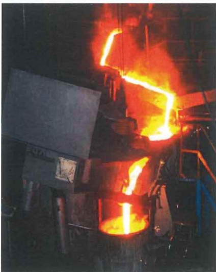
Cupola→Holding Furnace→Large Ladle